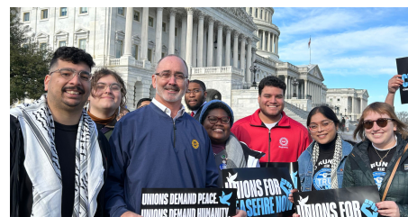
Many unions, including the UAW and UE, gathered outside the Capitol to demand a ceasefire now.

In the past, workers and their unions have taken stands to refuse to load war material, for instance bound for Iraq, and to refuse to unload goods such as from South Africa. The demand is to take similar actions now. ■