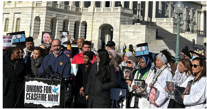
UAW's Shawn Fain speaks at the Unions for a Ceasefire Now press conference outside the US Capitol, December 14, 2023.

At a similar rally December 1 in front of the White House, the UAW announced its support for an immediate ceasefire in Gaza.