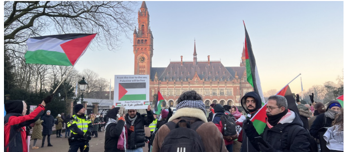
People gather outside The Hague to support South Africa's charges of genocide, January 11, 2024.

9. We can also put pressure on our countries to take their own measures against Israel if it refuses to comply. Words are not enough. Palestine needs action. UN resolutions without enforcement measures are useless.