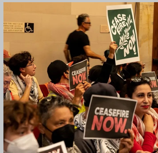
People pack Oakland City Council meeting and get resolution for a ceasefire in Gaza passed.

The resolutions of some, such as from Richmond, and Ypsilanti, Michigan, also call for ending US aid to Israel, with people denouncing the