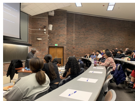
Political prisoner event, New Paltz, NY.