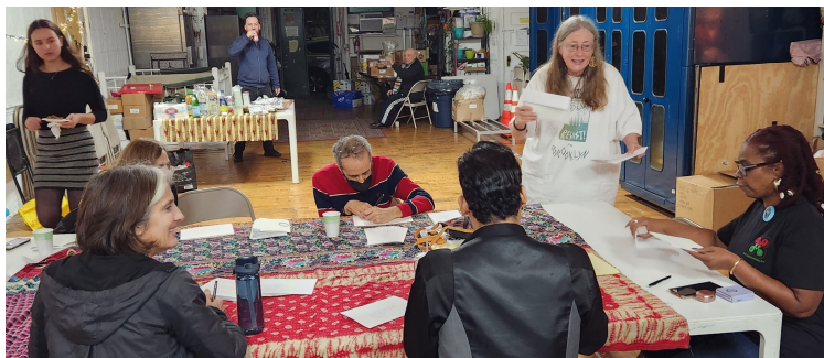
Resistance in Brooklyn holiday card-writing party for political prisoners.