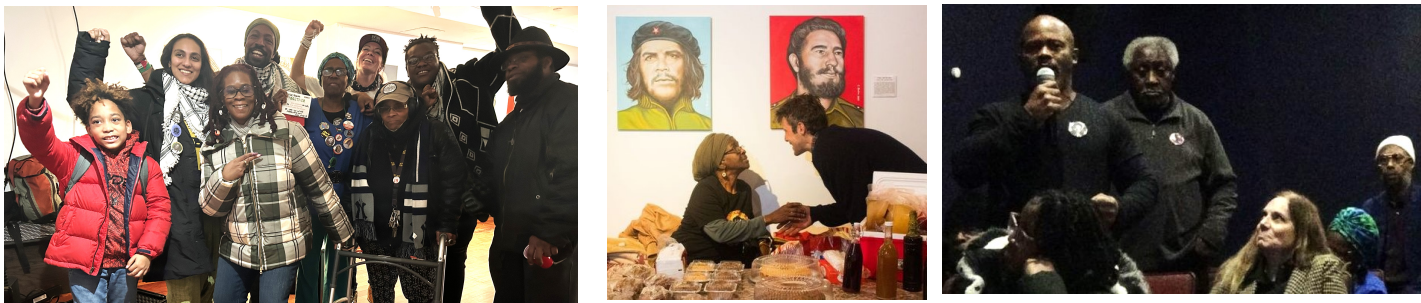
New York City "Welcome Home" event and film screening.

The Northeast Peoples' Senate project sponsored or co-sponsored three events in November and December. One was a two-day event that brought students and a former political prisoner together to discuss rights of prisoners and support students can give, at the State University of New York, New Paltz, November 10-11.